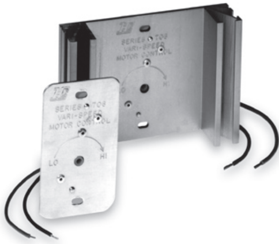
706-31 and 706-32 Series Electronic Motor Speed Controllers