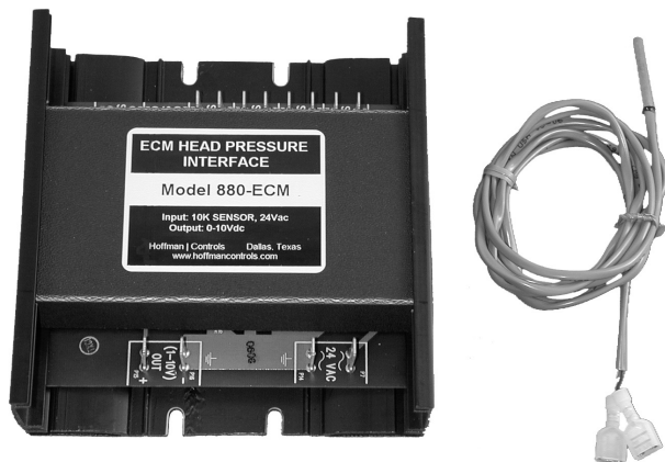
880-ECM Head Pressure Controller Patent Pending