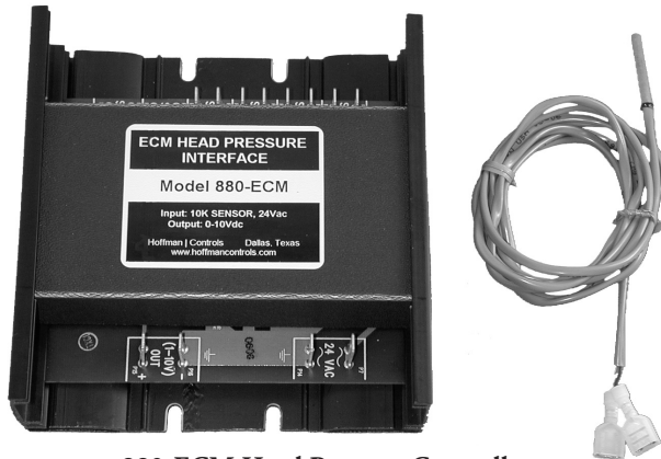
880-ECM Head Pressure Controller Patent Pending