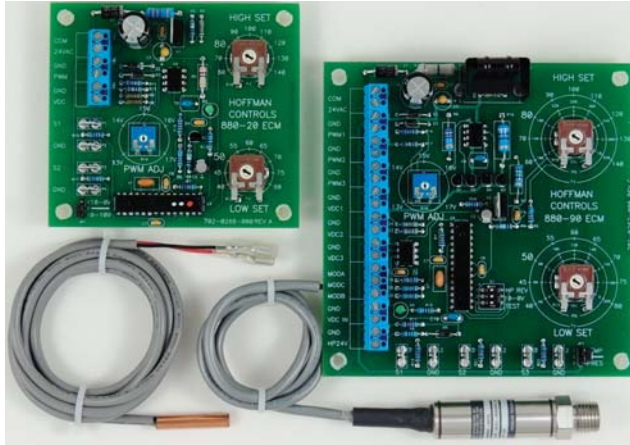
880-ECM(10)SSHP Head Pressure Controller