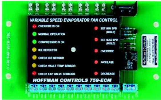
759-ECM Variable Speed Evaporator Fan Control