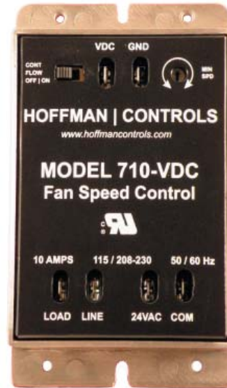
710-VDC Fan Speed Control

The 710-VDC Fan Speed Controller is only available for use with 115V and 208-230V applications.