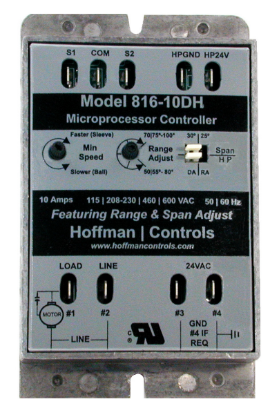
816-10DH Electronic Head Pressure Controller

The 816-10DH control does not include a transformer within the controller and will require an external 24VAC transformer.